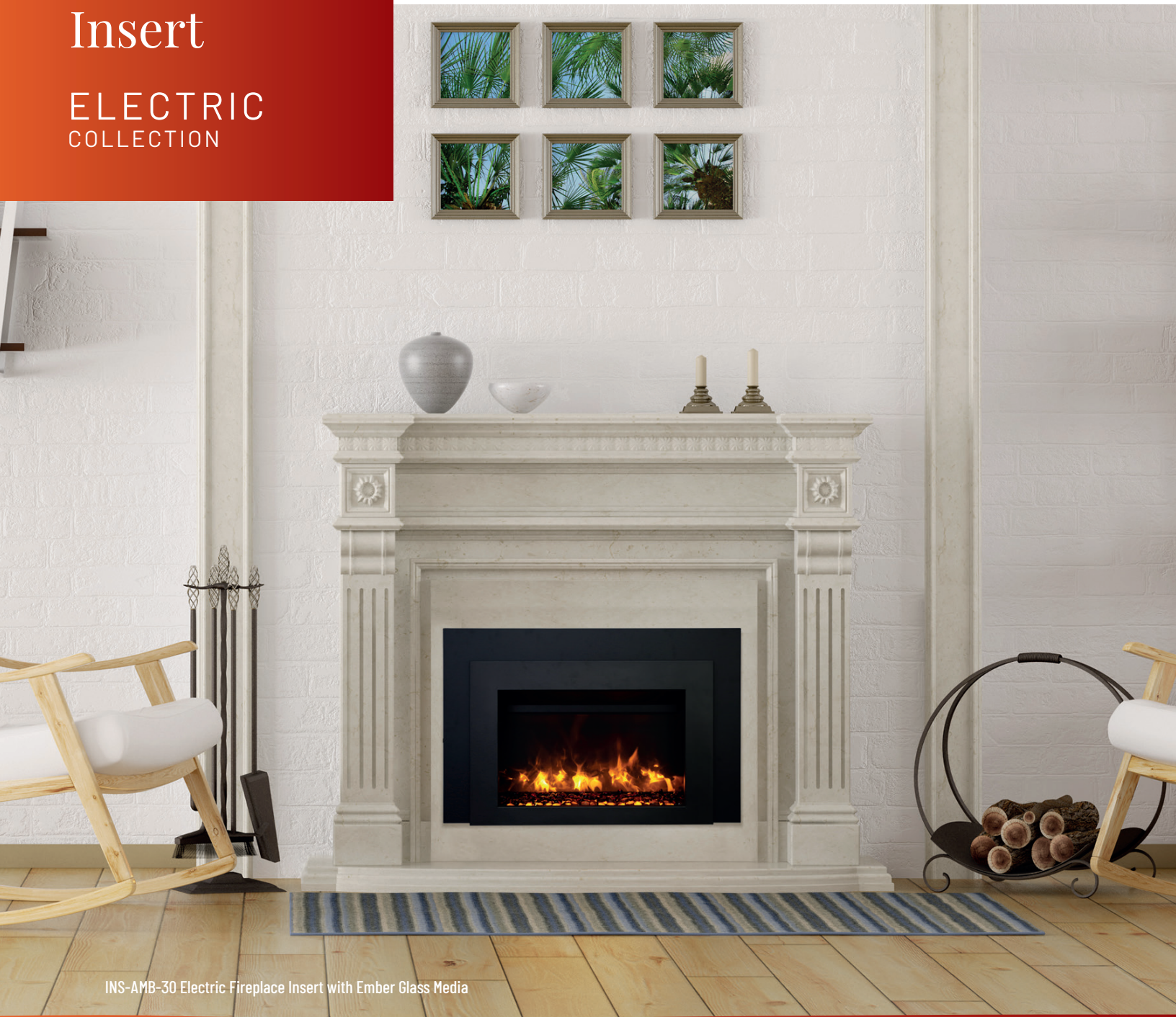
INS-AMB-30 Electric Fireplace Insert with Ember Glass Media