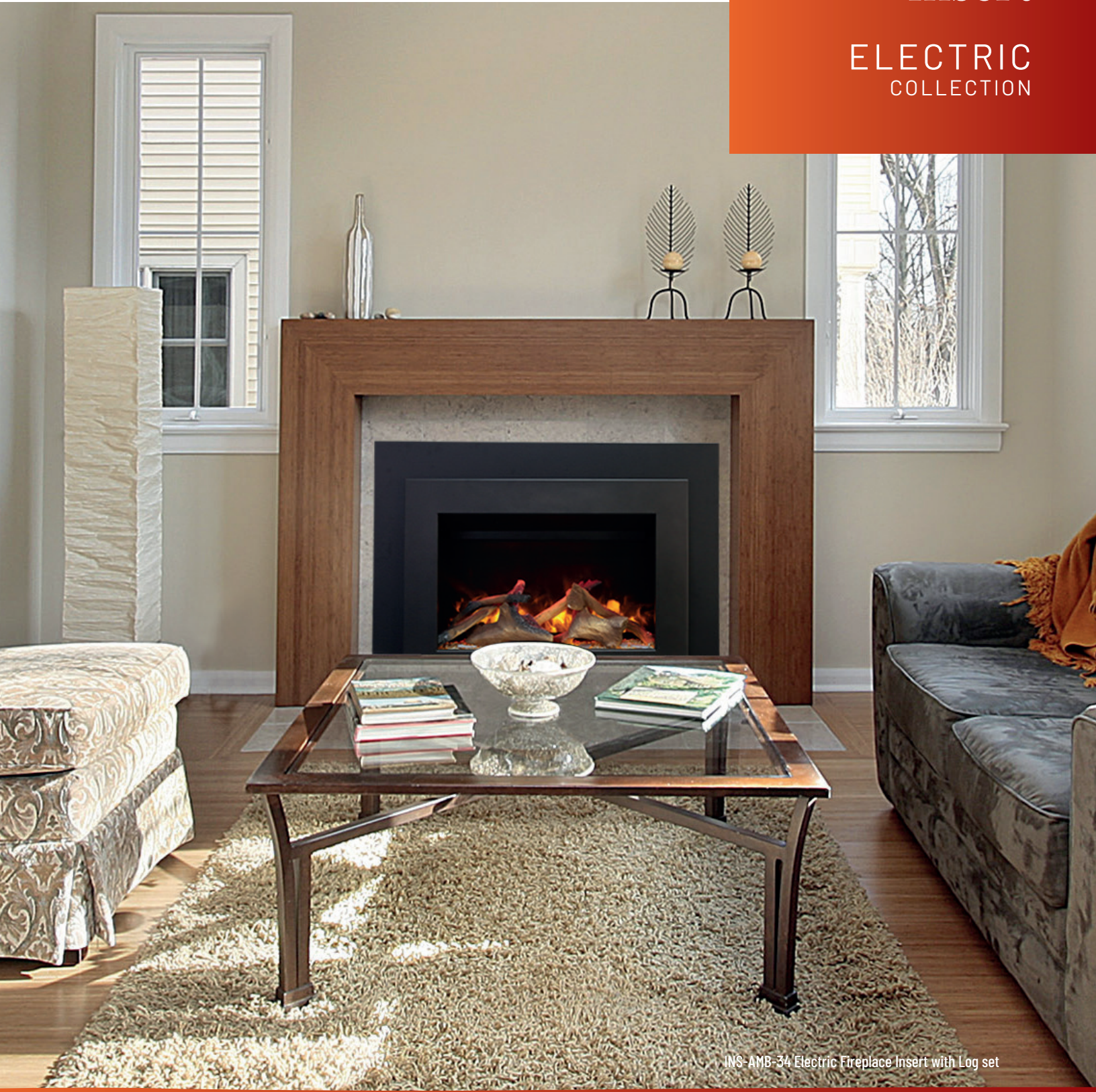
INS-AMB-34 Electric Fireplace Insert with Log set